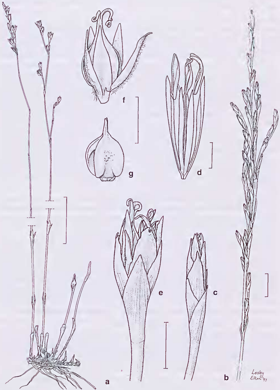
Fig. 4. Chordifex stenandrus . a, habit (holotype). b–d male: b, inflorescence. c, spikelet. d, flower, (Briggs 7475). e–h female: e, spikelet. f, fruit with perianth, (Briggs 7474). g, fruit (Briggs 8587). Scale bars: a = 5 cm; b–c, e = 4 mm; d, f–g = 1 mm.